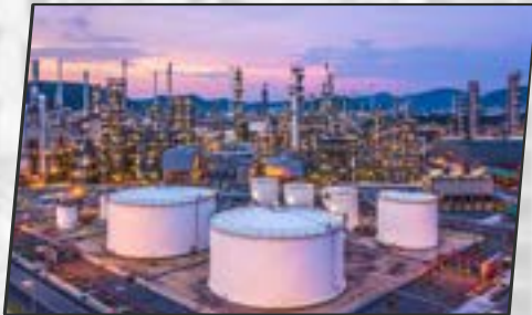
OIL & GAS INDUSTRY